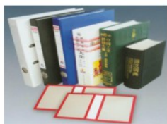
书壳 Hard Cover